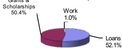
Type of Aid Awarded in 2018-19 (Number of Awards)