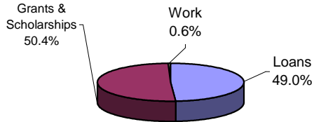
Type of Aid Awarded in 2008-09 (Number of Awards)