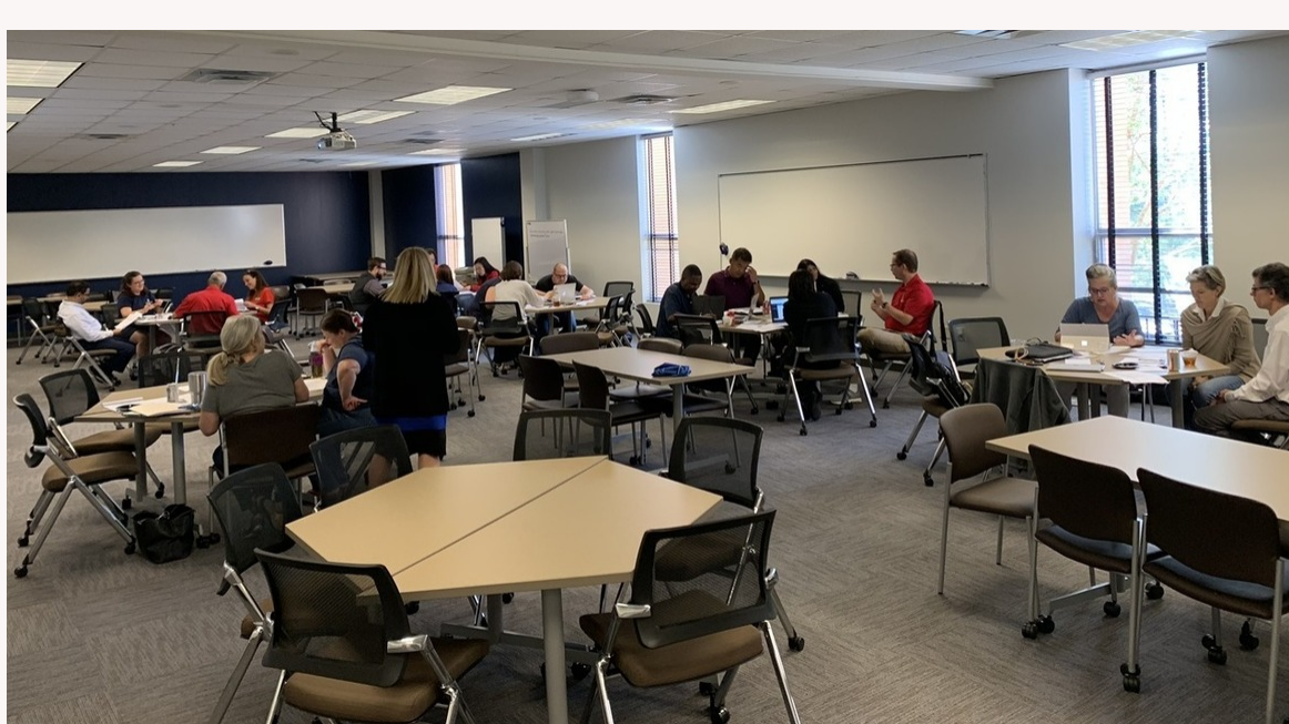
Faculty and Staff performing a norming exercise