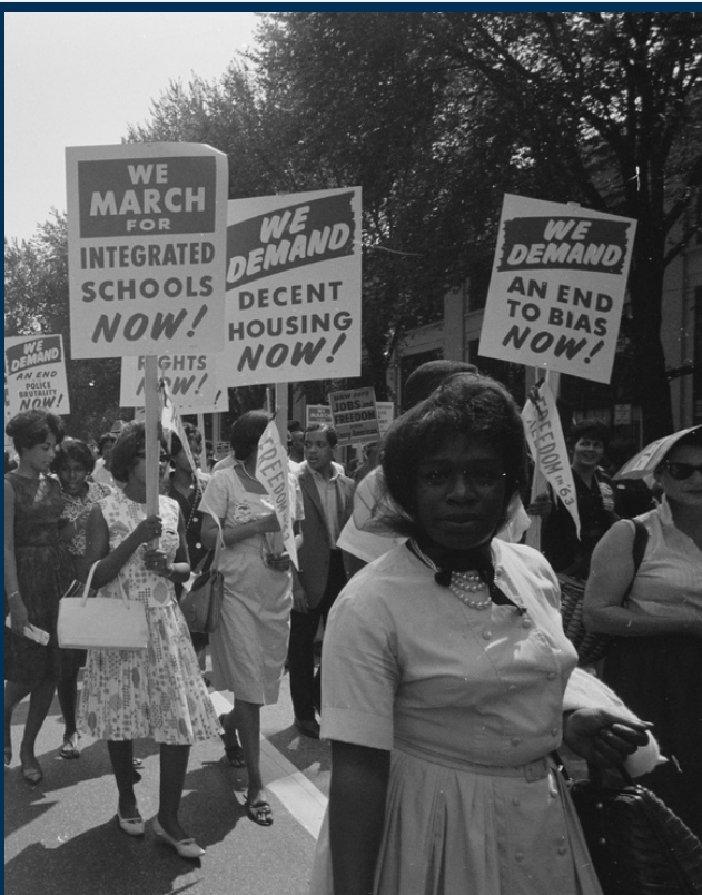
Civil rights era protest