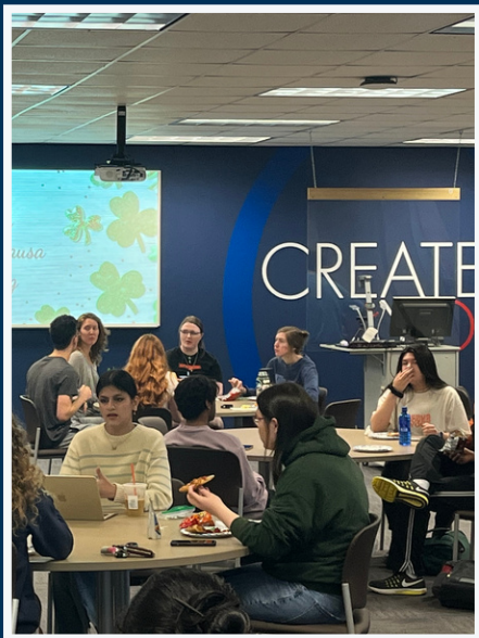
Students enjoy conversation and food at a monthly meeting!

This semester's courses explored many topics - with lots of connections to cultural significance. Before the spring semester even began during the J-term, 18 students in HONS 3555 had the once-in-a-lifetime opportunity to go directly to the source to study the effect of health disparities on Black communities, which culminated in a trip to NOLA to study the lasting impact of Hurricane Katrina. The spring semester HONS 3555 had a focus on the intersection of jazz and politics during the Civil Rights Era. Other courses this semester involved a deep dive into international politics and an analysis of the recent resurfacing of many politicians 'caught' wearing Blackface.