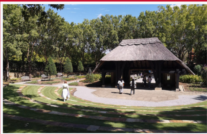
A thatched-roof pavilion from the Alabama Shakespeare Festival.

This deep dive into dreams culminated in a trip to the Alabama Shakespeare Festival in Montgomery. At this festival, students were able to watch a production of Shakespeare's A Midsummer Night's Dream .