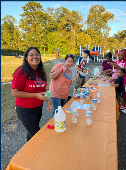
STEM Night at Lee County Schools