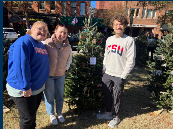
Uptown Tree Trail