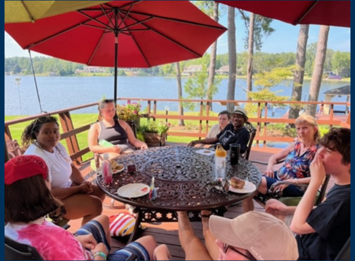
Back to School Picnic