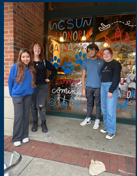
Paint the Town