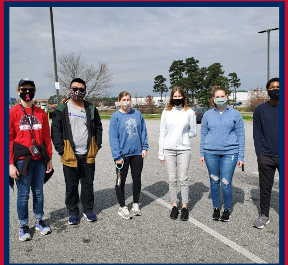
Students participated in Clean-Up Columbus