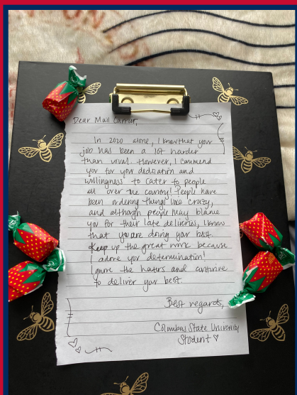
"Thank a Mail Carrier"