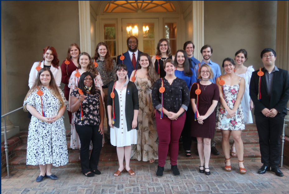
2020-2021 Graduating Class