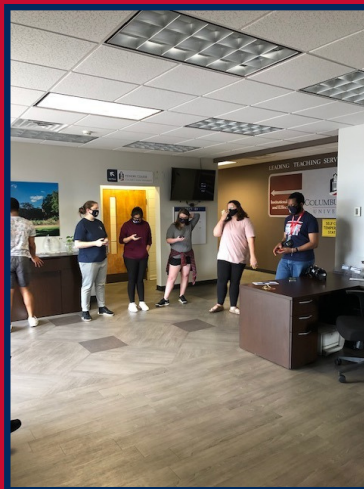
Getting prepped for the popular "Among Us" Game