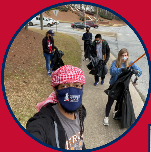
Students participated in Clean-Up Columbus

This semester, our students began to slowly host activities safely in person. All of the events and meetings were socially distanced and brought out students together for fun and servant leadership outside of classes.