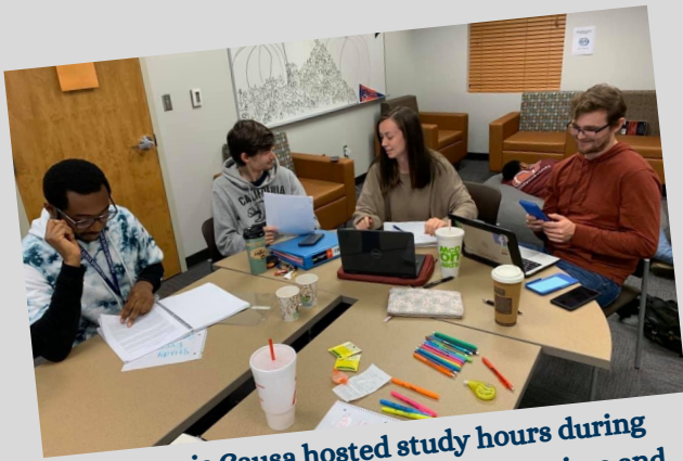
Honoris Causa hosted study hours during finals. The participants had a great time and maybe got some studying in...

Honoris Causa is the student organization sponsored by the Honors College. Honoris Causa translates into “for the sake of honor” in Latin and characterizes the dedication and leadership exhibited by its members through its many campus, community, and cultural activities. Members in the organization work together on student-generated service projects, advising and shaping the CSU Honors College curriculum, and coordinating academic and social events.