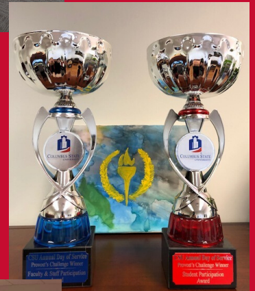
Trophies for Day of Service Awards