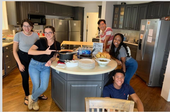
Preparing lunch at the Ronald McDonald House