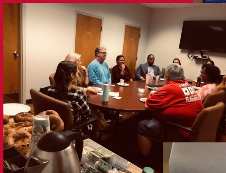
"On the Table Chat"