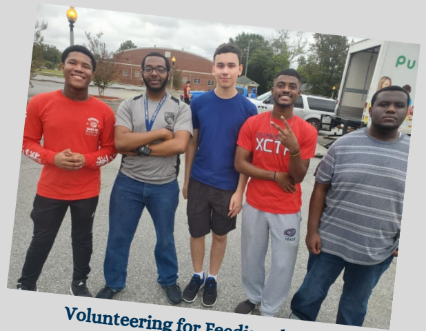
Volunteering for Feeding the Valley