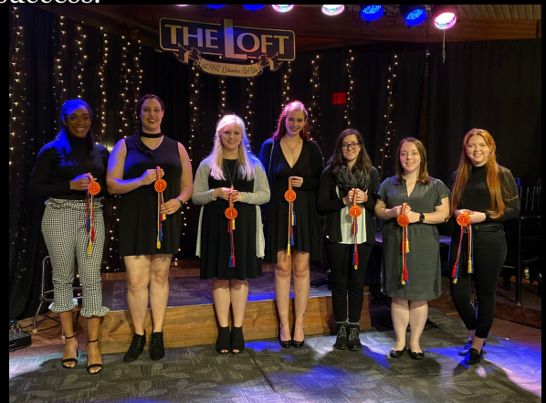
Our Fall 2019 Honors College Graduates