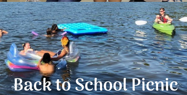
Back to School Picnic