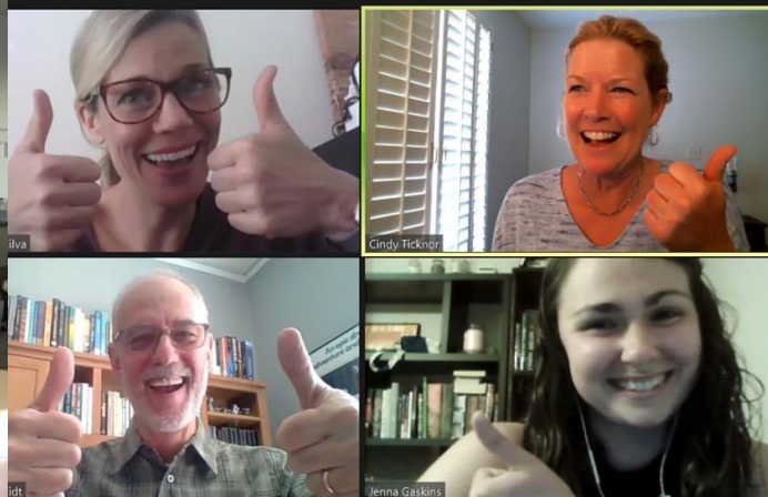
Virtual Thesis Defense