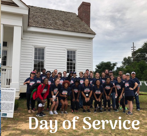
Day of Service