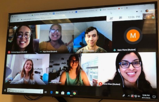
Honoris Causa Office Meeting