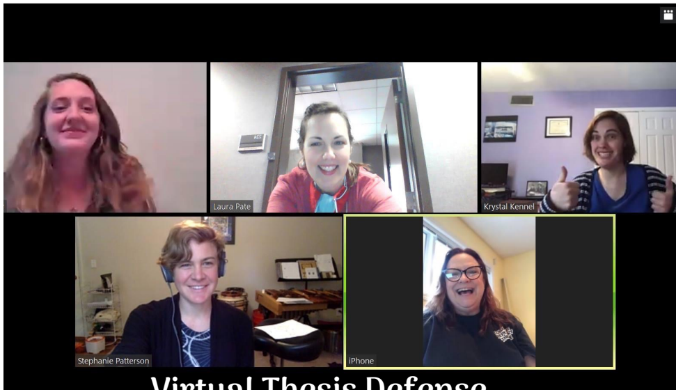
Virtual Thesis Defense