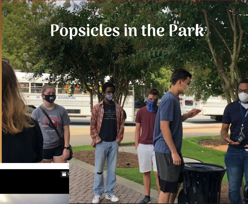
Popsicles in the Park