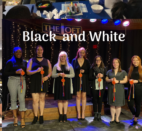
Black and White