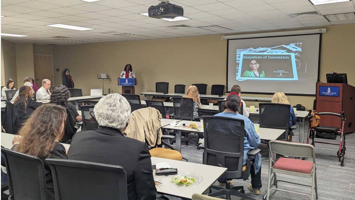
On April 24th, the CSU Library hosted the encore of the Rapid-Fire Research Race. Five professors from all four academic colleges presented their research in four minutes with four slides, and answered questions afterwards in a panel session. The topics discussed ranged from research into what works in online teaching to how to transpose Bach's work for clarinet. This was a great experience for faculty and students to see the amazing research faculty are working on!