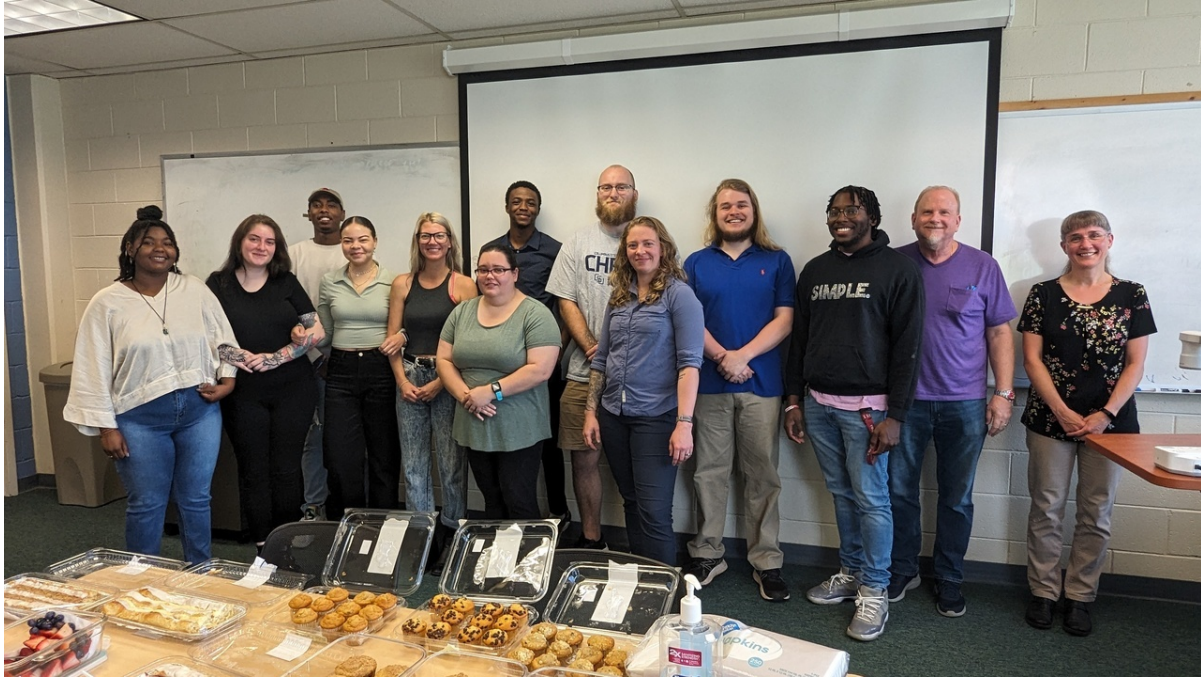
On Friday, April 19, 2024, the Department of Biology hosted a celebration of the accomplishments of the graduate students in the Biology Track of the Master of Science in Natural Science Program. Each of the currently enrolled 13 biology graduate students gave a 3-minute presentation on their thesis-based research, internship experience, or on what they hope to accomplish while a graduate student at CSU. All of the graduate students gave excellent presentations - from first-semester students to students in their final semester. At the end of the celebration, graduate students and attendees mingled during an informal question-answer session while they enjoyed baked treats together.