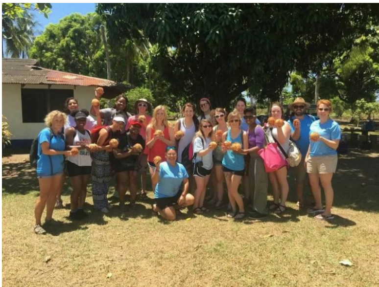
CSU in Costa Rica 2017