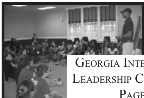
GEORGIA INTERNATIONAL LEADERSHIP CONFERENCE, PAGE 3