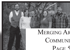
MERGING ART AND COMMUNITY, PAGE 5