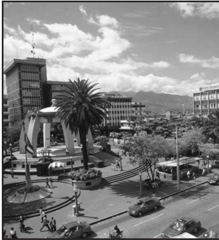
San José, Costa Rica