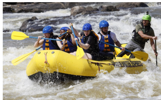
Getting wet and wild on the Chattahoochee River also gives Columbus visitors a "raft-by" tour of Columbus State's RiverPark Campus.