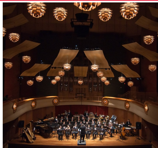
Columbus State's performing arts programs and facilities located at the RiverPark Campus provide the community with more than 300 concerts and theatrical performances annually.

Learn more about what makes Columbus an amazing place to call home at amazingcolumbusga.com/live