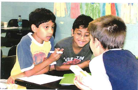
Serious Fun. PSI participants know that three heads are better than two when it's time to solve challenging problems.