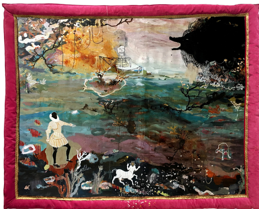
The Divine Comedy , 2018 Mixed media, stuffed fabrics, embroideries 90 ½" x 108" x 4 ½"