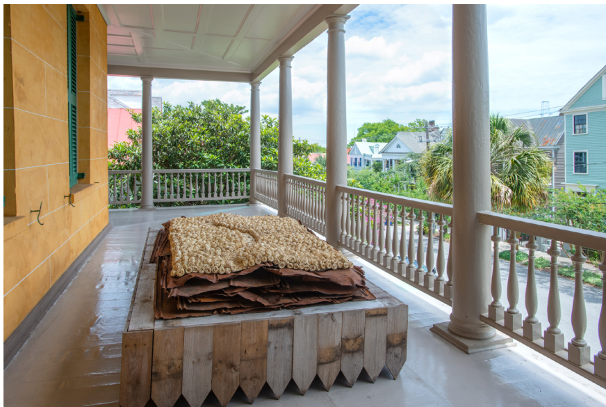
Eulogy at Water's Edge, 2019/2021 Palm leaves, handwoven roses, tin roof and fence (Installation Aiken-Rhett House, Charleston, SC, 2020) 80" x 44" x 30"