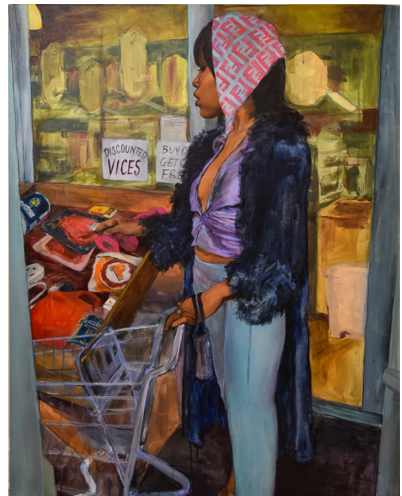
not as i do , 2020 Acrylic on canvas 40" x 32"