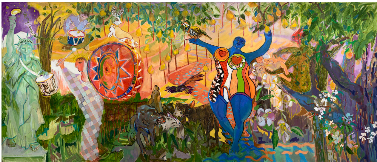
Pears , 2021 Oil on canvas 86" x 192"