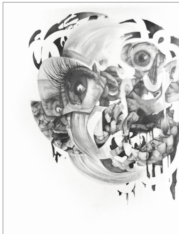
Amalgamation #4, 2019 Graphite on mylar 50" x 39"