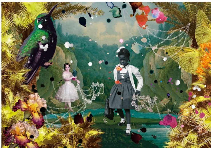
Marielle Plaisir, R. Bridges (The Malediction of Cham Series) , 2021, printing on Duratrans archive paper framed in stuffed fabric, 63" x 42 1/2" x 4 1/2"

As in previous years, few of this year's Southern Prize artists are concerned with specific "Southern" issues. Only Williams explicitly