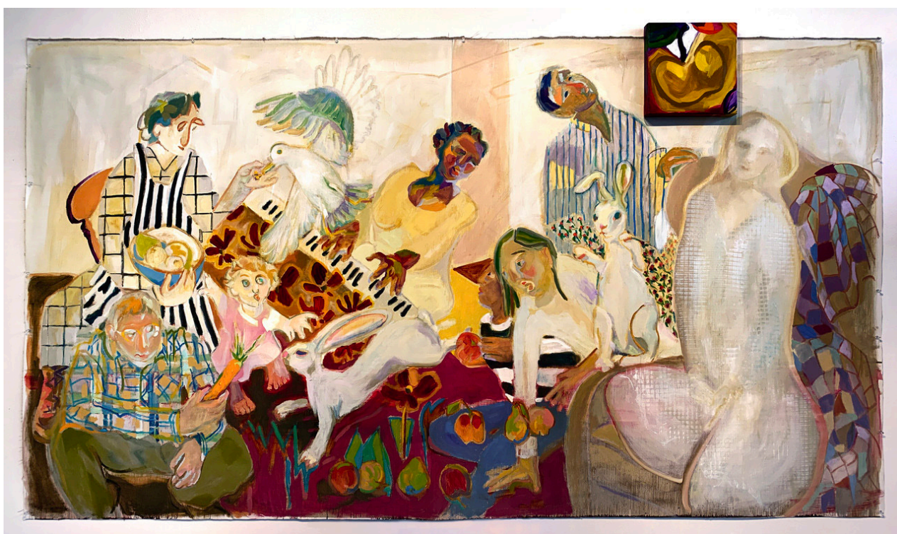
Work In Progress , 2020 Oil on canvas 58" x 92"