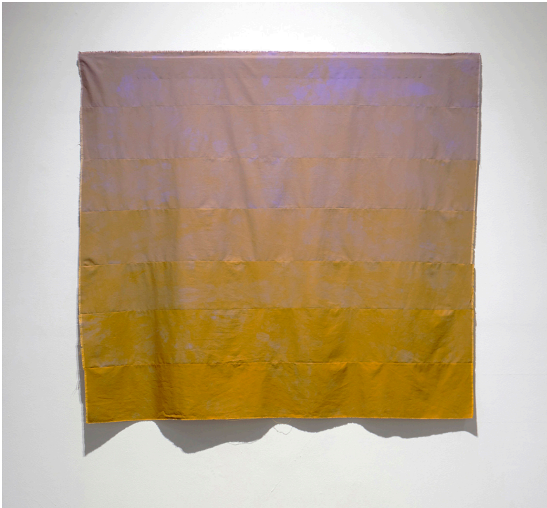
Mixed #13, 2019 Hand-dyed textile 50" x 50"