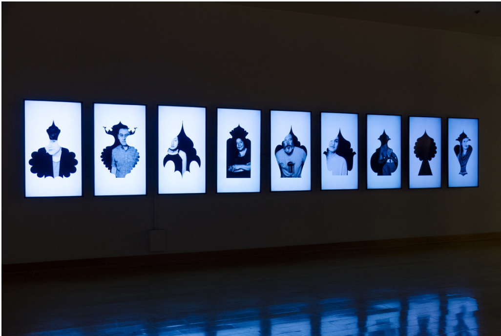
Imagined Boundaries Episode 2 (Alert; Miscommunication) , 2019 – 2021 Five-channel video installation (Georgia Southern University, Statesboro, 2020) Dimensions variable