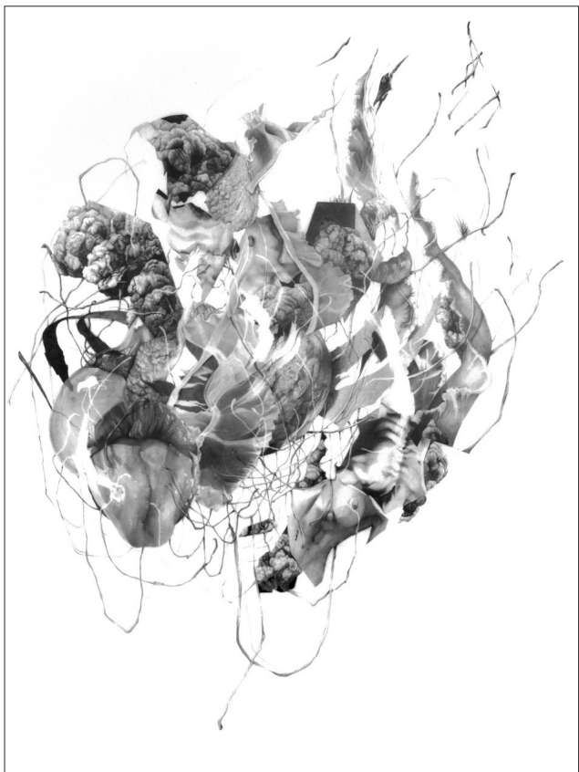
Amalgamation #3, 2018 Graphite on mylar 50" x 39"