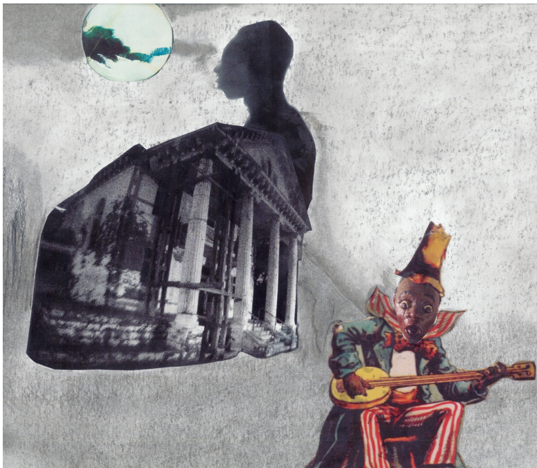
The Ghost Summons , 2020 Mixed media and charcoal on paper 14" x 17"