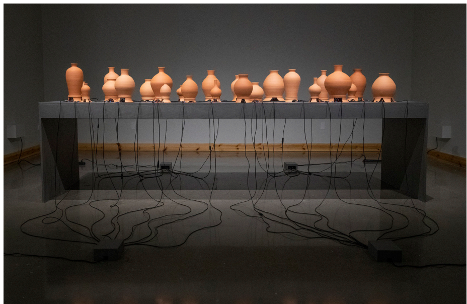
The Inh(a/i)bited Space , 2018 – 2021 Multimedia installation with ceramic vessels, wire and sound (University of Houston Downtown, TX, 2018) Dimensions variable