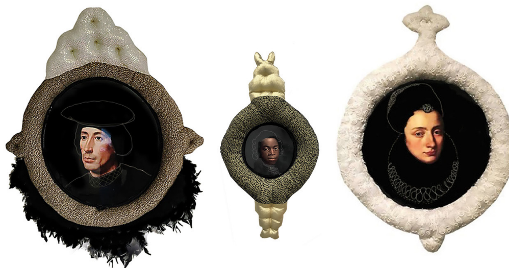
Blue Blood, Black Blood Series , 2018