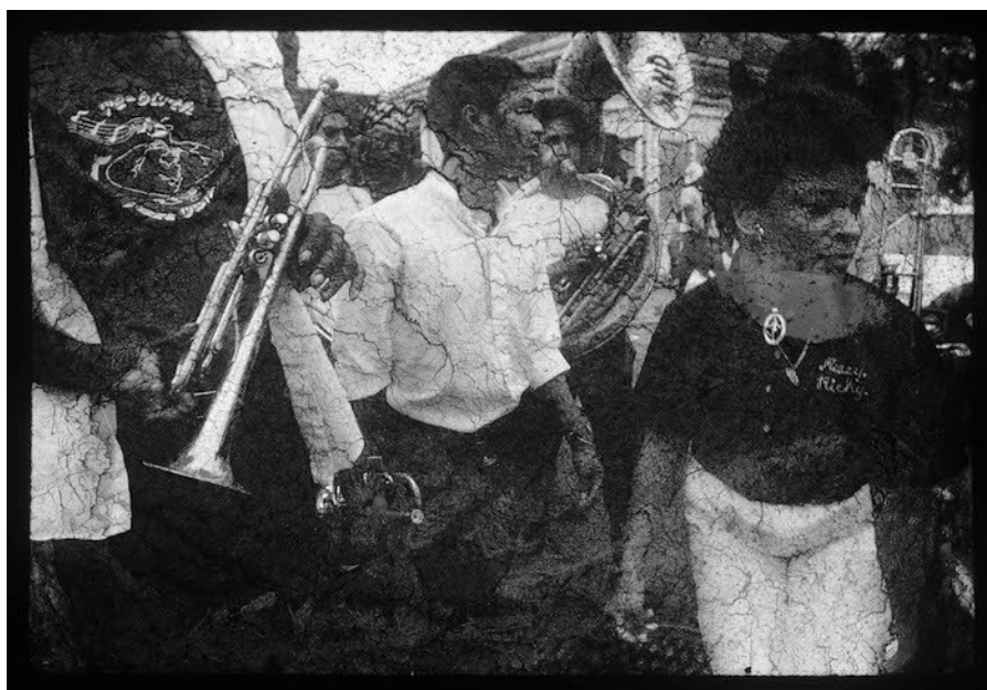
We Are the Music , 2000/c.2018 Printed transparency rescued from flood waters 30" x 44"