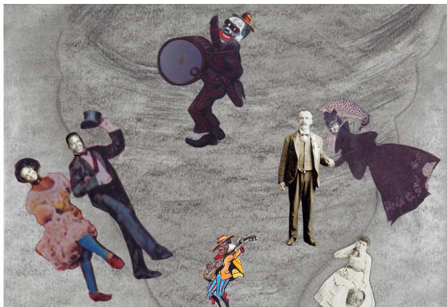
Spirits Song , 2020 Mixed media and charcoal on paper 14" x 17"