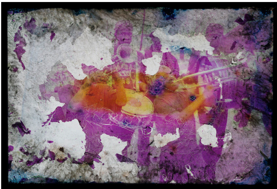
Skin and Bone , 1996/c.2018 Printed color transparency rescued from flood waters 34" x 44"