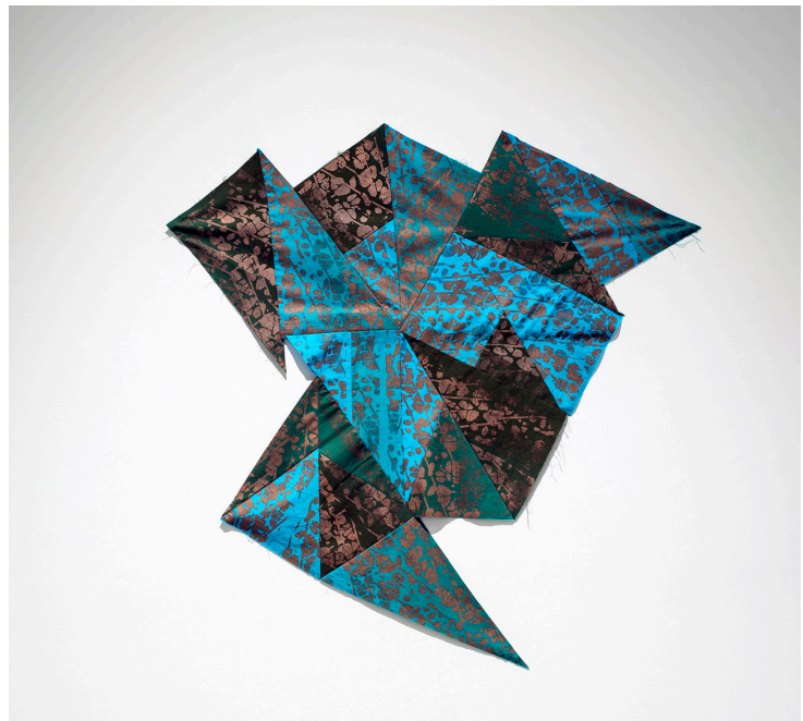
Piecework #37, 2019 Hand-dyed and screen-printed textile 47" x 40"