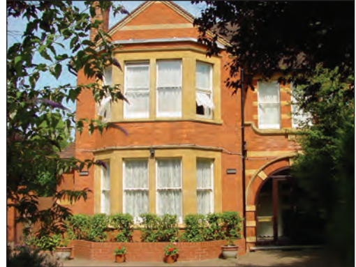
CSU Spencer House, Oxford, England