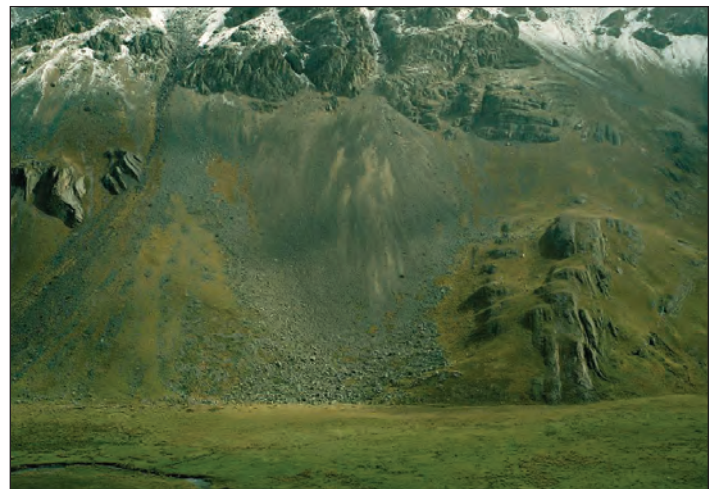
(Above ) From The Canary Project: Works on Climate Change 2006-2009