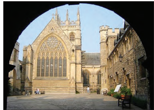
Merton College, Oxford, England

Studio Open House and Student Art Sale at the Corn Center for the Visual Arts, November 19, 2009 at 5:00 p.m. just in time for the holidays, enjoy refreshments, meet faculty and students, walk through the state-of-the-art studio spaces and purchase work by our talented art majors.