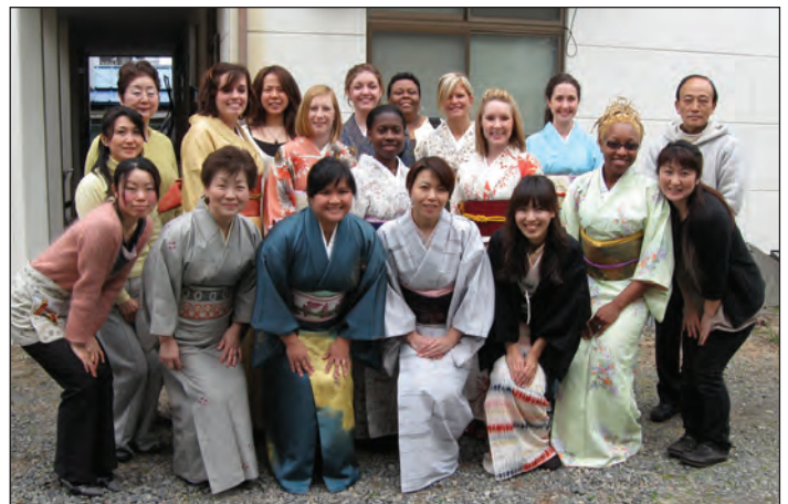
Study abroad art students dressed in traditional kimonos in Kiryu, Japan.

The ten-day trip was invigorating and eye-opening, and the students equally enjoyed the time spent in both Tokyo and Kiryu. Many students have already commented that they hope to return to Japan in the future.