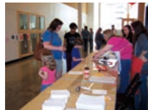
Children and parents enjoy Family Art Day in the Corn Center for the Visual Arts in March, 2012.