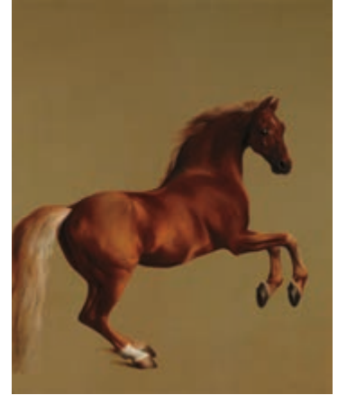
George Stubbs, Whistlejacket , 1762

Space is limited and reservations are $20 per person for each Art Talk and Tea. For more information, call the Department of Art at 706-507-8301.