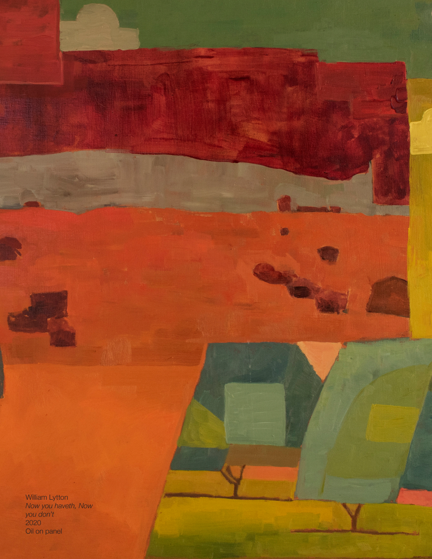
William Lytton Now you haveth, Now you don't 2020 Oil on panel