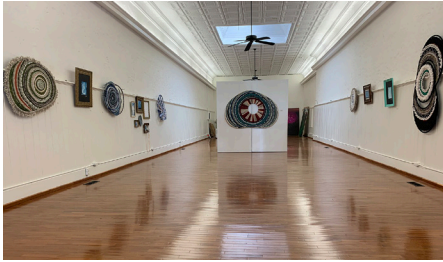
Cami Batts White '15' and Brittany Shepard '15 Exhibition: Alternative Process Cochran Gallery, GA September 11 – October 31, 2020