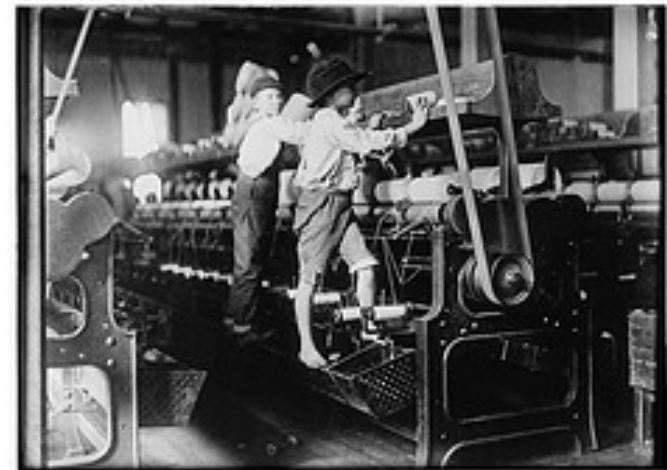
Children working in the Bibb Mill, Macon, Georgia 1909.

What was it like to be a kid in Bibb City? Come and find out . . .