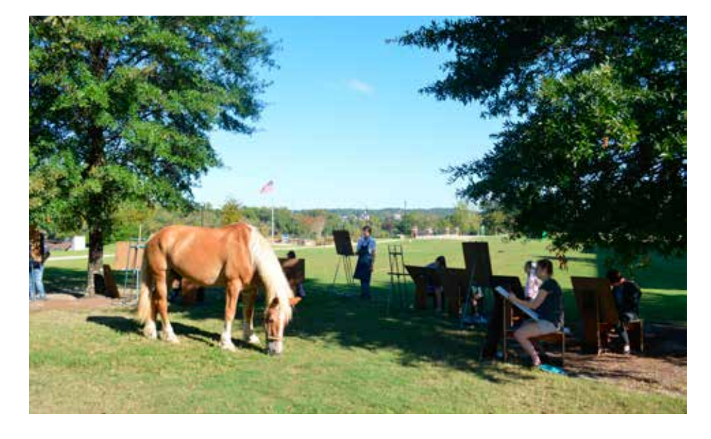
Art students and community members draw Max the horse during a special CSU drawing event in Woodruff Park on the river this September.

Congratulations to all winners and participants in the Columbus State University 2015 Student Juried Art Exhibition at the Corn Center for the Visual Arts!